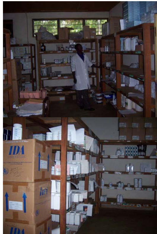
Part of the Pharmacy

These drugs arrived when the Hospital had a very critical drug shortage. People's lives have been saved because of your generosity. May the good Lord continue to bless you and guide you in everything that you do. As we are producing this Newsletter we are waiting for another drug consignment which might arrive end May from Friends of Medical Mission Sisters as well through IDA. The spirits of these vulnerable patients will always remember your kindness and pray for you always! Holy Family Staff wish you het allerbeste! 'Mulungu Akudalitseni' (May the Lord continue to shower you with his blessings)