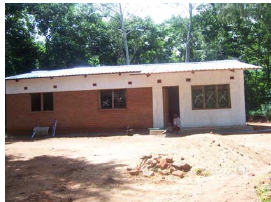
Below is a senior staff house which is on the finishing stage also funded by Cordaid

There are two houses being constructed with funding from Cordaid. The semi-detached was completed and has been occupied whilst the senior house is in finishing stage. The construction of these houses has indeed eased the housing problem which was a major challenge at Holy Family Mission Hospital. These Semi-detached houses are being occupied by Nurses.