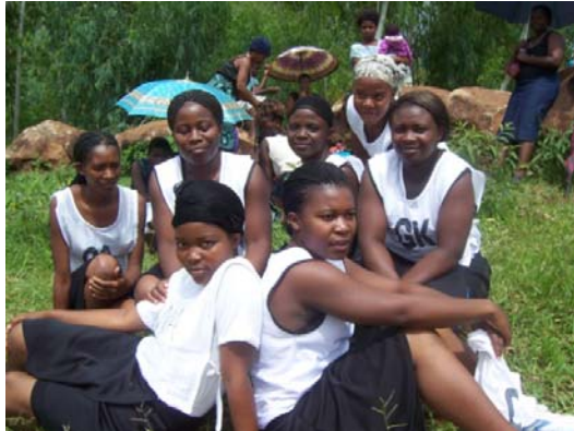
The Queens of Holy Family

Holy Family Netball Team joined the Presidential Initiative for sports Cup.