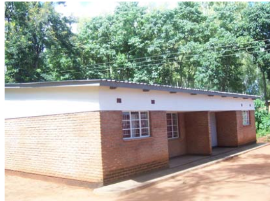
ONE OF THE SEMI-DETACHED HOUSES FUNDED BY CORDAID

There are two houses being constructed with funding from Cordaid. The semi-detached was completed and has been occupied whilst the senior house is in finishing stage. The construction of these houses has indeed eased the housing problem which was a major challenge at Holy Family Mission Hospital. These Semi-detached houses are being occupied by Nurses.