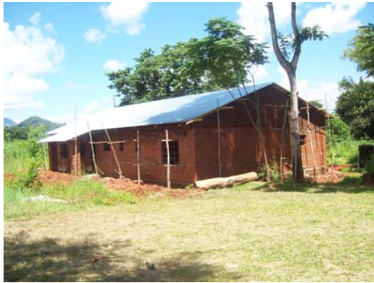
The senior staff house financed by Beitrust

Receive a Vote of Thanks from Management, Staff, Patients and Guardians!! GOD BLESS!!