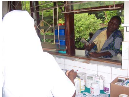
A client being assisted at Pharmacy on a Clinic day

Despite this great achievement, the Clinic is operating its services in poor structures. The ART Clinic is accessible to all patients and is free of charge (no consultation fees)